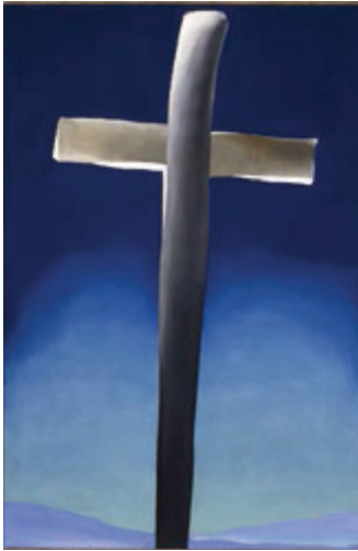
4. Grey Cross with Blue , 1929 Georgia O'Keeffe Oil on canvas 36 x 24 in. Albuquerque Museum of Art, Albuquerque, NM