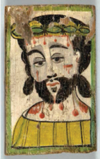
6. St. Veronica's, Handkerchief , c. 1820–62 José Rafael Aragón Painted wood 6 1/2 x 3 15/16 in. The Harwood Museum of Art of the University of New Mexico Gift of Mabel Dodge Luhan