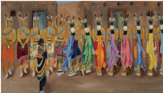
5. Turtle Dance , 1947 Dorothy Brett Oil on canvas 28 x 47 in. Millicent Rogers Museum, Taos, NM